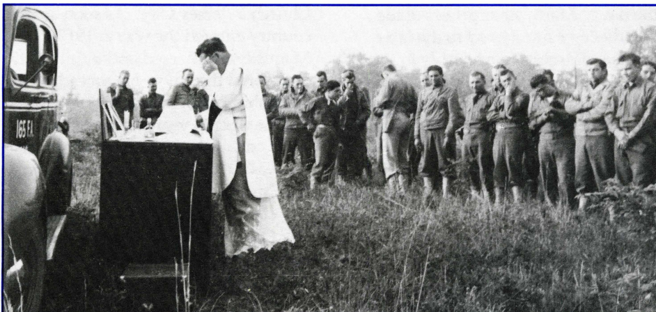
Mass in the field, probably during training at Camp Carson.