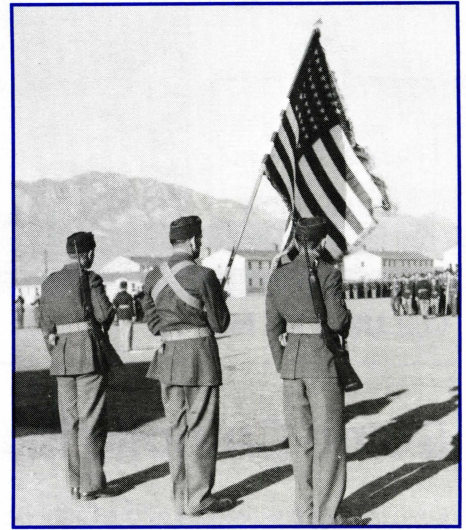
Preparing for a formal review in training camp, probably Camp Carson, Colorado.