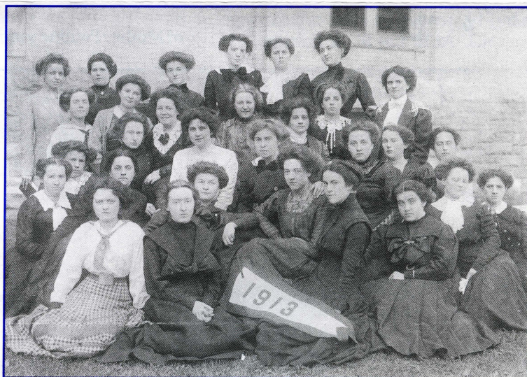
The Class of 1913 assembled for their picture as entering freshmen.