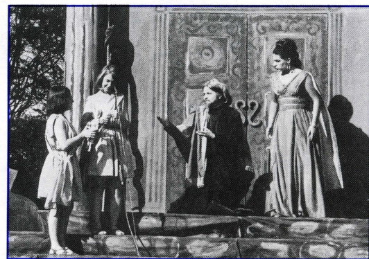
Euripides' Medea being performed in the college's Greek Theater in 1965.

The college has remained steadfast throughout the century in its commitment to providing a liberal education informed by Catholic ideals and values while at the same time responding to changing societal needs and opportunities. When, for example, older women began to apply to colleges for the opportunity to complete interrupted studies, or simply to expand their intellectual horizons, Saint Elizabeth's established a continuing education program in 1970 to meet this need. Later, Weekend College provided opportunity for older adults to earn a degree while employed full-time. As the complexity of American society began to demand greater preparation of the work force, the college in the 1990s gradually