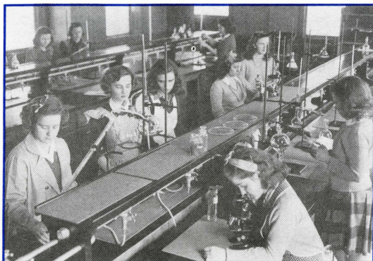
Chemistry lab in the 1940s