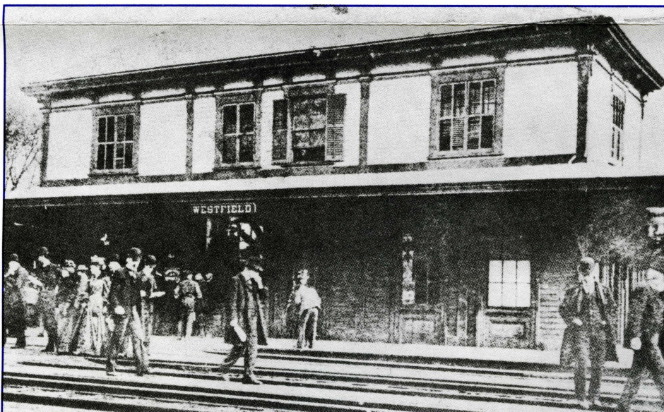
Central Railroad freight office in Westfield, site of Sunday Mass for local Catholics in 1872-1873.