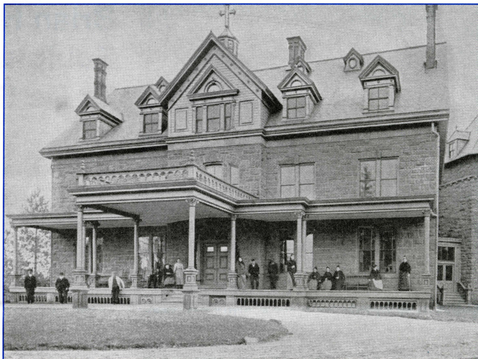
House of Divine Providence in 1902.

Catholic parochial schools, and the replacement of teaching sisters by laity in many instances. Work in hospitals has also seen a great decline in the number of Sisters involved. The 1995 Official Catholic Directory indicates that the number of women religious in the state is now just over 4,100. While those who recollect the way it had been tend to