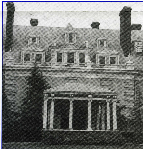
The mansion of George Gould, now part of Georgian Court College.