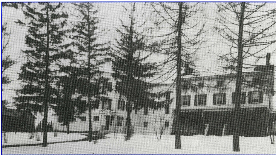
The first home of St. Joseph's Hospital, Paterson, in 1867.

Nor should anyone forget the silent contribution to all this active work, the prayers and penances of the contemplatives in Bordentown, Paterson, Newark continued on page 3