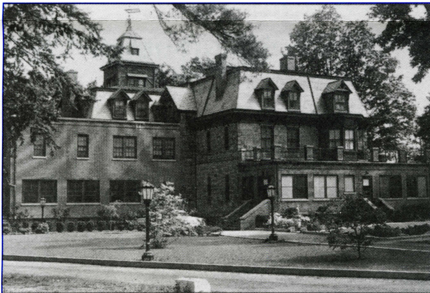
Villa Victoria Academy, Trenton