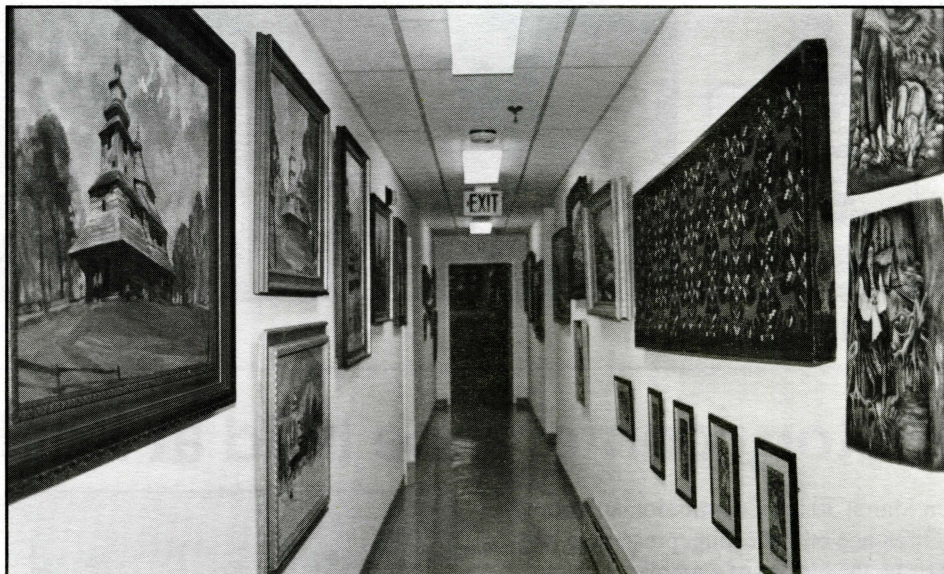
Above: This gallery exhibits some of the paintings of prominent East European artists.