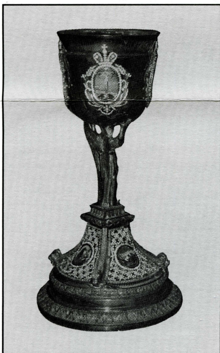
Highly decorated chalice from the collections of the Heritage Institute.