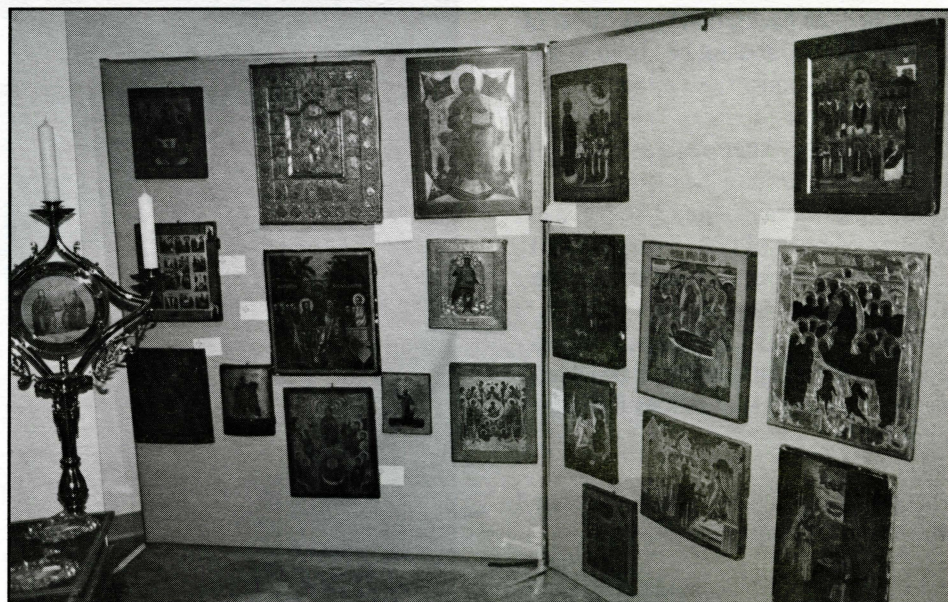
Below: Some of the icons, both ancient and more recent, are shown in this view of one of the galleries.