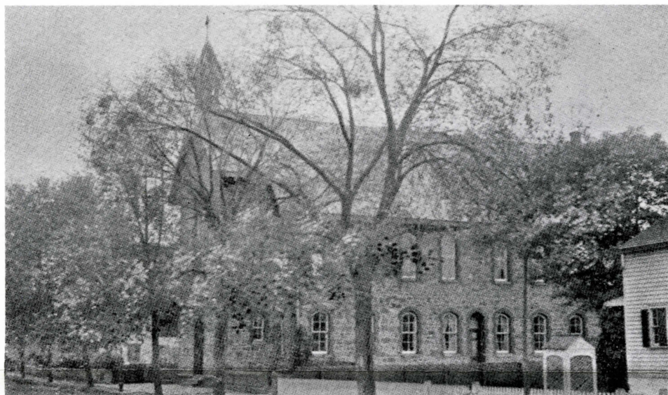
ABOVE: Sacred Heart Parochial School, circa 1893.

The Commission hopes that others who possess or know the location of source materials for the history of Catholics in the state—sermon notes, sermons, diaries, correspondence, pictures, anything, in fact, that tells us who we were, so that we may better understand who we are and where we may be going—will contact the archivist at 761-9476 or write to the Commission at Seton Hall University.