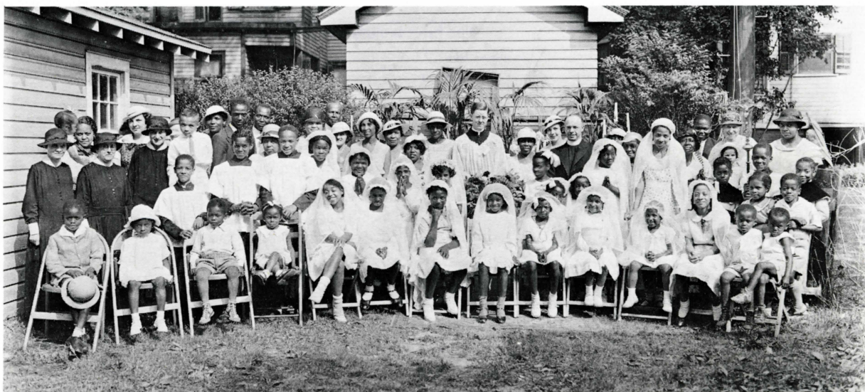
RIGHT: First Communion group at Holy Spirit Church.