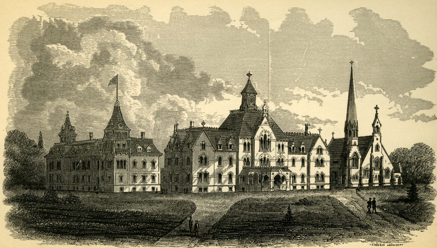
SETON HALL COLLEGE.