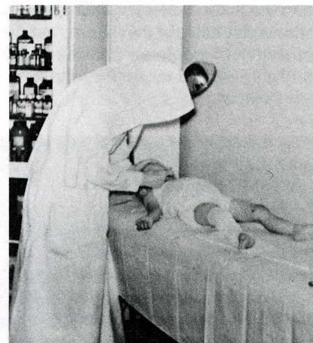
A Sister treats one of the children.

The available records do not show Archbishop Boland's response, but the