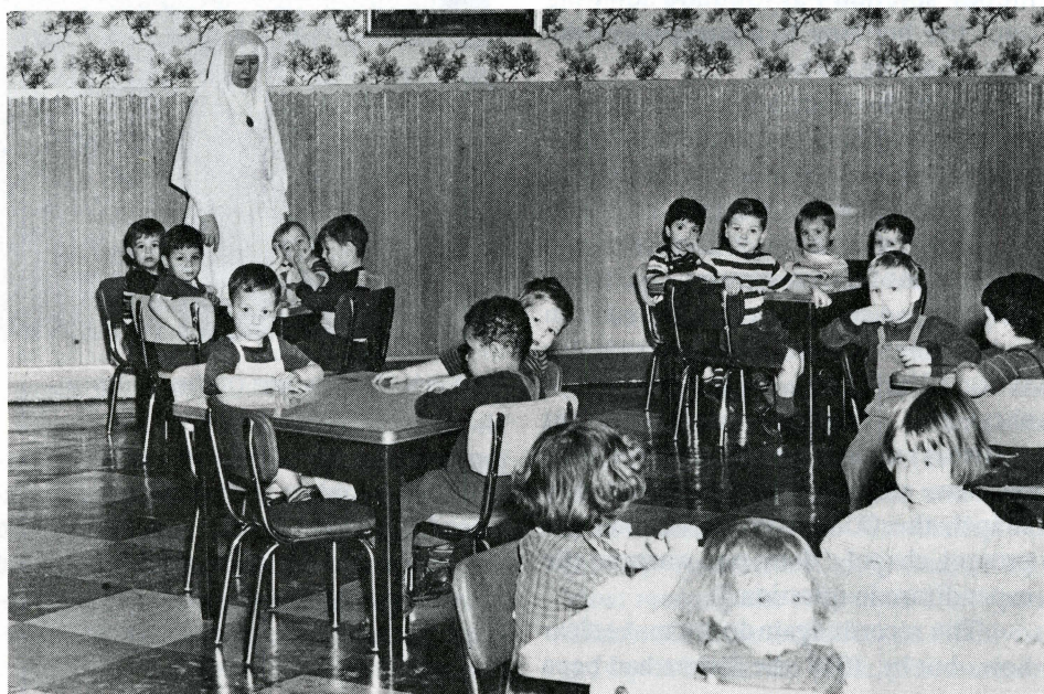
Children in the dining room at St. Walburga's, about 1940.