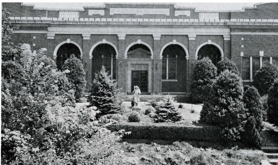
Front entrance to the orphanage, about 1940.