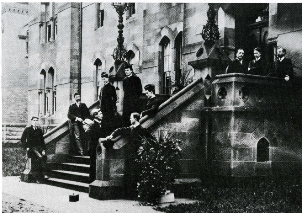
Seminarians on the steps of President's Hall, home of the Seminary before its removal to Darlington in 1927.

The primary purpose of the Seminary is to prepare students for the ordained ministries of the church by training them for a life of prayer and worship, by leading them to an understanding of the life and witness of the Church . . . and by helping them acquire the necessary tools for teaching and preaching, for pastoral care and parish administration.