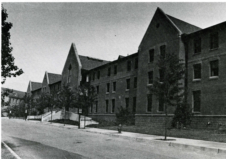
Milton and Rita Lewis Hall, home of Immaculate Conception Seminary on the South Orange campus of Seton Hall University.

Conditions for admission to the Seminary in 1955 included completion of the freshman and sophomore years at Seton Hall University, with the recommendation of the president and faculty. In