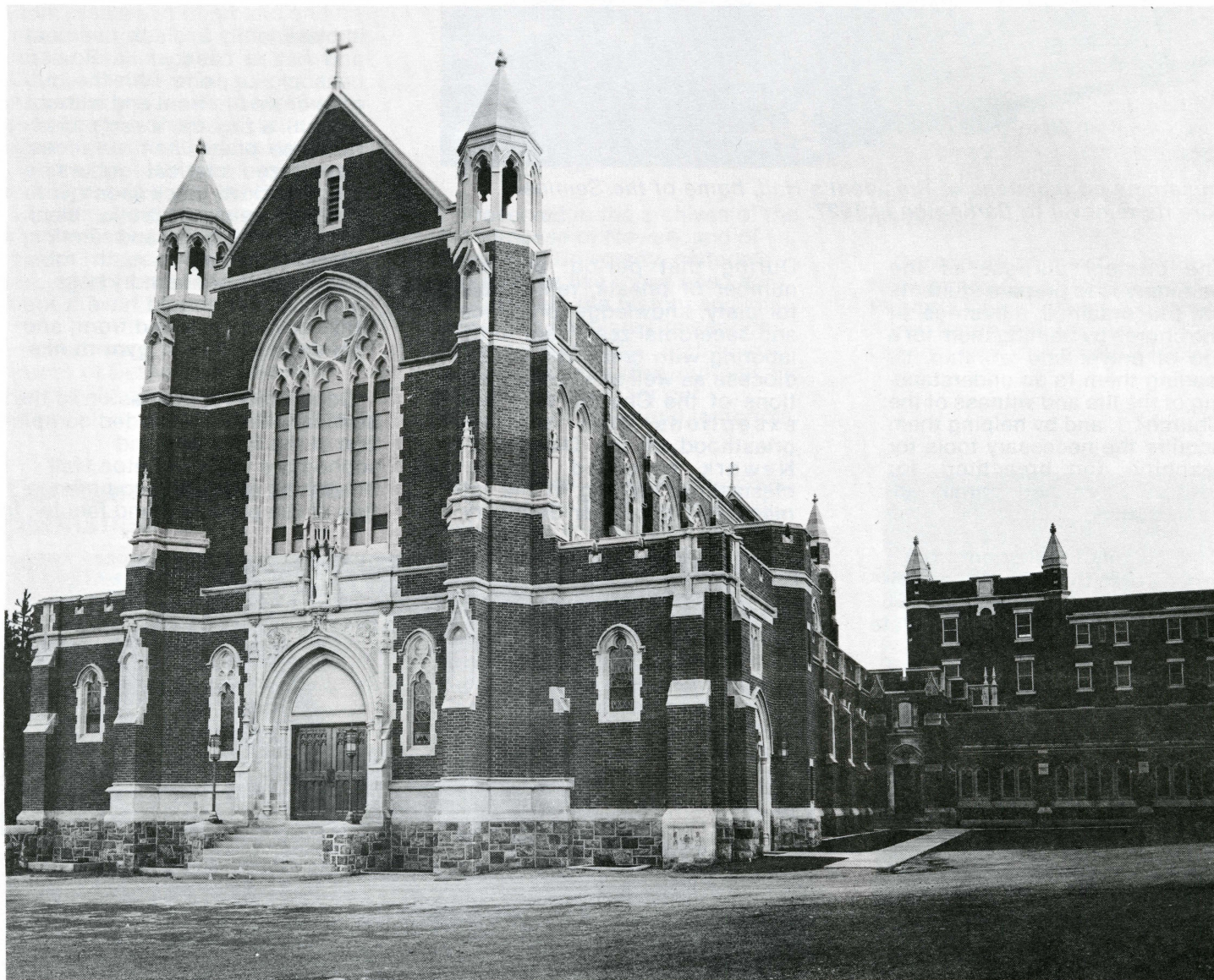
Chapel of Christ the King on the campus of Immaculate Conception Seminary, Darlington.