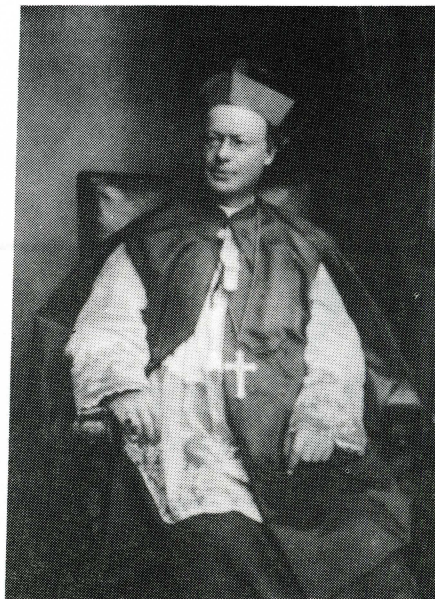
Michael Augustine Corrigan.

Contributions may be sent to New Jersey Catholic Historical Records Commission—Dougherty Fund, Seton Hall University, South Orange, New Jersey, 07079-2696.