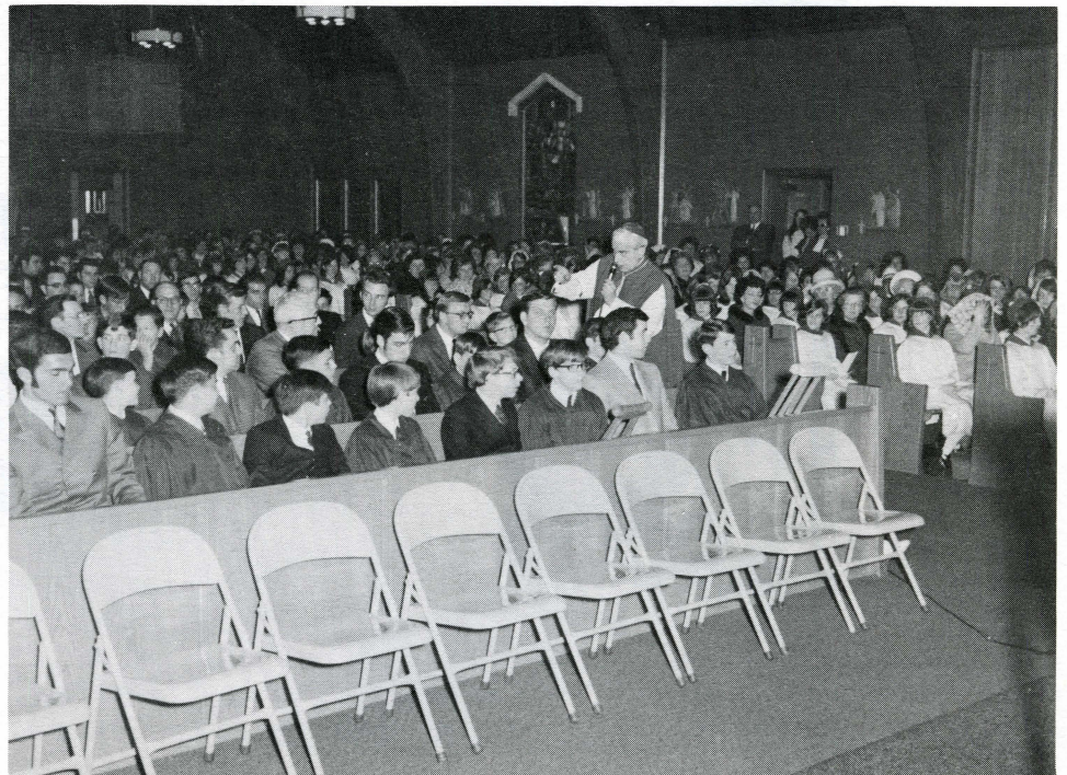
Confirmation at St. Gabriel's Church, Upper Saddle River.

sity. His appreciation of scholarship and his determination to make the university the best it could be led, over the next decade, to a notable expansion of facilities and more importantly to a broadening and deepening of academic programs. His open, friendly manner and his manifest interest in everyone he met developed on the campus a sense of common participation in a worthy educational and cultural project; his emphasis on the Seton Hall community as a "family" was reflected in everyone's sense of belonging. (continued on page 4)