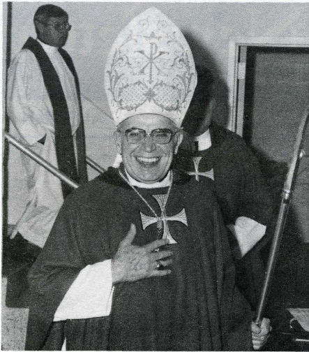
Robed for the liturgy.