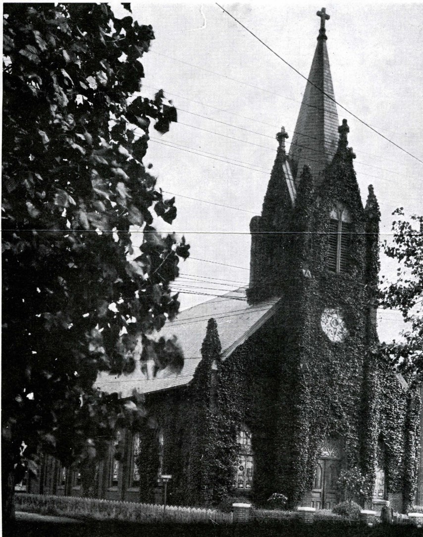
Holy Trinity Church, Perth Amboy, N.J., completed in 1902. The growing Slovak community of Perth Amboy began organizing a parish in 1895, and established Holy Trinity Parish in 1899. The picture shows the third structure used for Mass. The first was a church rented from the Congregationalists; the second a small frame building erected by the men of the parish.

Trenton's official diocesan weekly newspaper began publication on February 5, 1954, so that "the cause of religion generally and the particular interests of the Church's many institutions could be advanced more effectively" according to the first issue. In addition, its editors expressed a desire to "bring the people of the widely scattered parishes together in a closer bond of friendship and unity." Early issues contained a diverse blend of international, ecclesiastical, and local news. Readers pursuing the paper in 1954 could find information concerning Catholicism in France, missionary work in Africa, efforts to form an Ancient Order of Hibernians chapter in Keansburg, and the Middlesex County Catholic Bowling League standings. One consistently conspicuous feature of the early issues was the space devoted to activities of the Catholic Legion of Decency. This organization's motion picture classifications, efforts to influence Hollywood productions and network television programming, and weekly reviews of controversial films received extensive coverage. In 1983, The Monitor began publishing a special weekly edition for the newly created diocese of Metuchen, and this is also available at the NJCHRC archives.