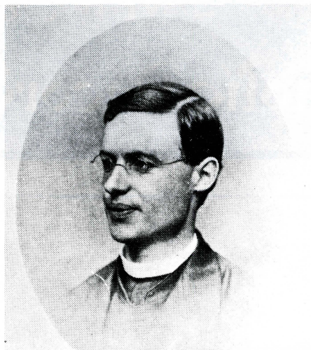
The Reverend M. A. Corrigan, D.D. President of Seton Hall College 1868

The 1870s constitute an especially interesting decade in New Jersey's history. Large urban commercial and manufacturing centers like Newark, Paterson, and Jersey City, the smaller industrial towns of Trenton and Hoboken, seashore resort communities such as Cape May and Long Branch, and sparsely settled agricultural regions all appeared on the New Jersey landscape during this time and received Corrigan's candid first-hand commentary. Rapid urbanization and industrialization characterized the period, and