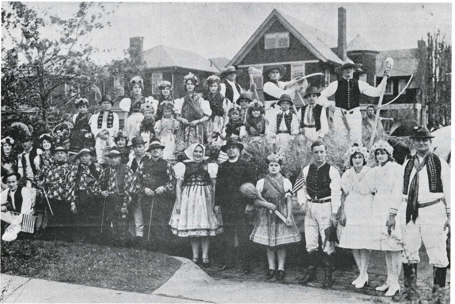
Parishioners of St. Mary's Greek Catholic Church, Trenton, in Carpatho-Russian costume for an Old Country Harvest Festival in the autumn of 1929.