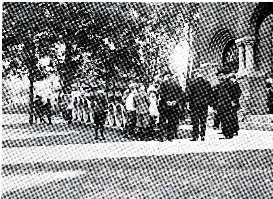
A knot of interested parishioners examines the new chime of bells for the Church of St. James, Red Bank. The bells were displayed in front of the church preparatory to being blessed and installed.

Suburbanization also affected the area, as second and third generation Americans moved out of northern New Jersey's cities and constructed middle-class communities in Middlesex and Somerset counties. Further, the post-World War II period witnessed a large increase in the area's Spanish Catholic community. Dominicans, Cubans, Puerto Ricans, and other Hispanics found jobs in factories and industry, and their experiences offer an interesting