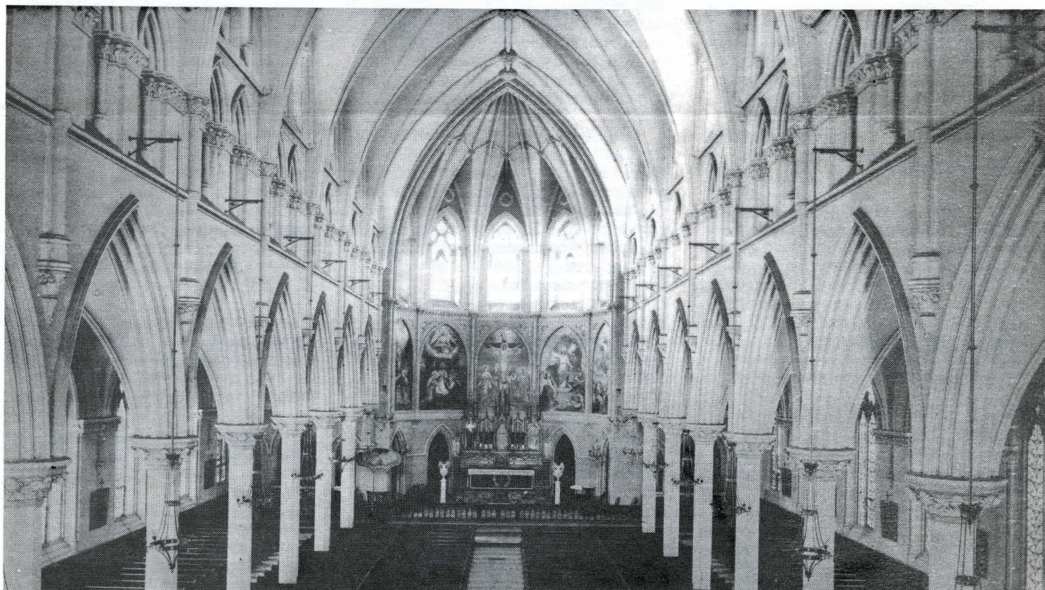
Interior of St. Patrick's Catholic Church