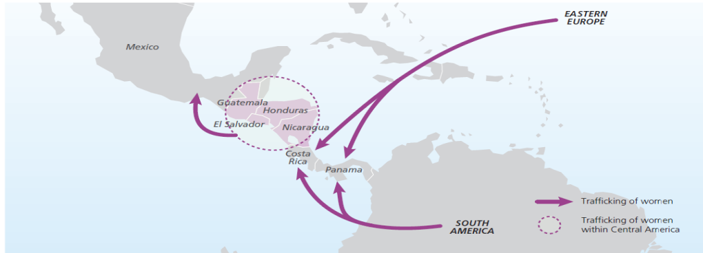
Map 10: Trafficking flows of women and girls in Central America, 2011

generally runs from developing to more developed countries. 187 The greatest flow of both human trafficking and migrant smuggling is to the United States. 188