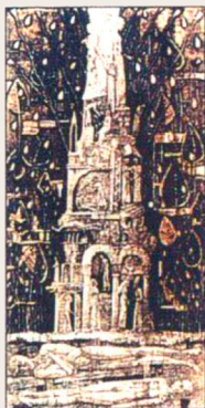
Evil's Skull Fine No. 1, Lithuania 1993