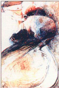
The Wind II 2000