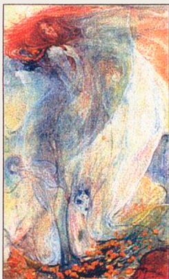
The Spirit 2000