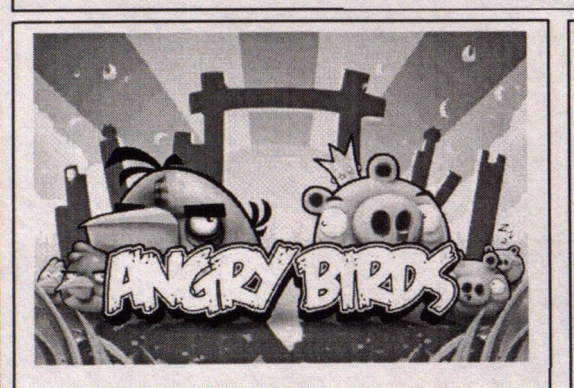
2011's Most Checked-out Rodino Library Book: The Angry Birds Strategy Guide