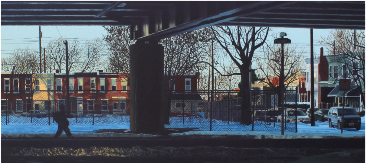
Underpass oil on canvas 18" x 40" 2010