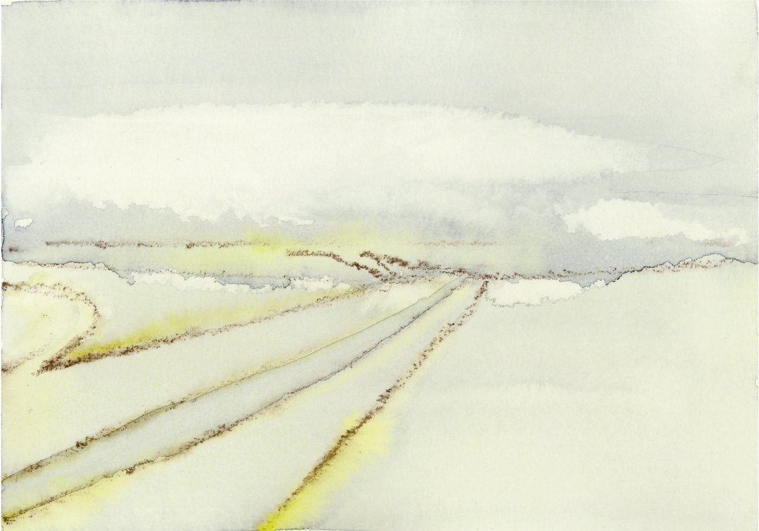
Trafficland #21 watercolor and graphite 9" x 12" 2011