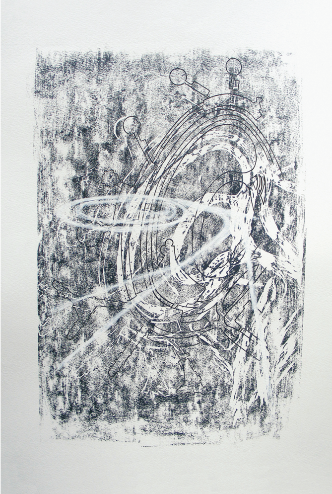
See Something, Newark Airport 30" x 22" woodblock print, pen, acrylic 2011