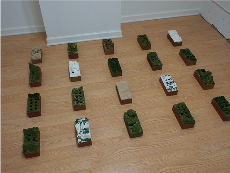
Brickscapes bricks, model train landscaping material, foam, gel medium dimensions variable 2011