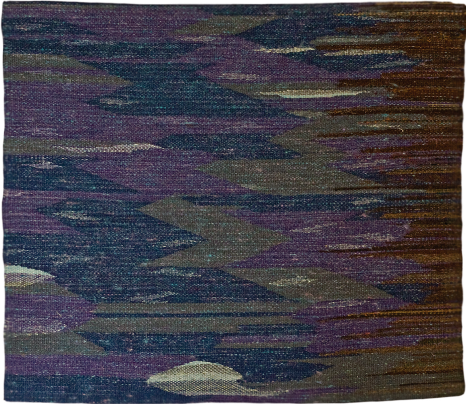
Wawayanda: Lookout Lake wool tapestry 33" x 38" 2006