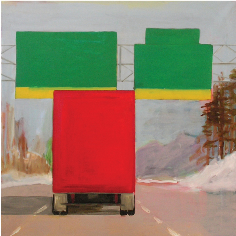
Coca Cola Truck acrylic on canvas 48" x 48" 2006