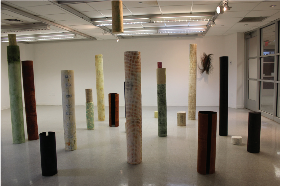
Flow of Time steel, rice paper, glue dimensions variable 2011