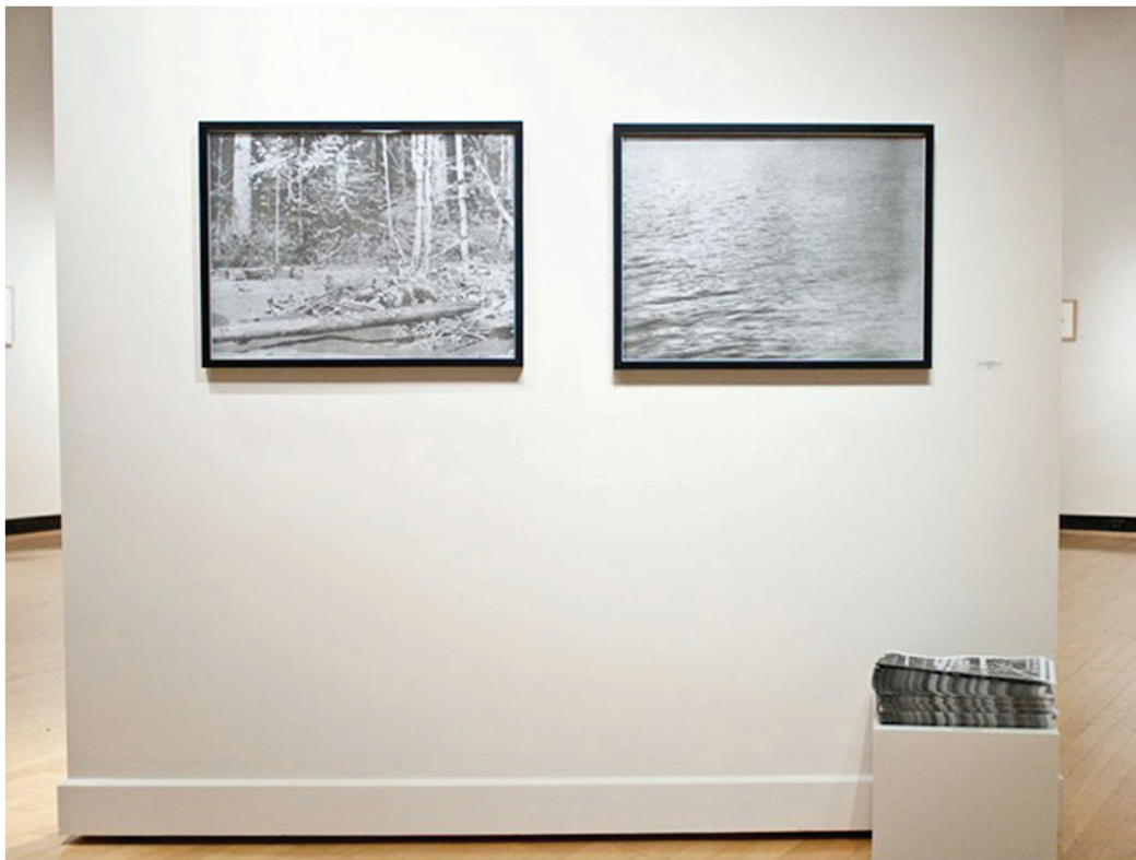
Burden of Proof installation dimensions variable 2011