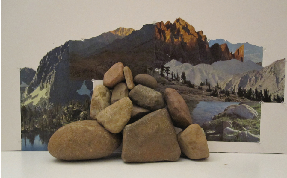
Sierra Nevada rocks and found photographs dimensions variable 2012