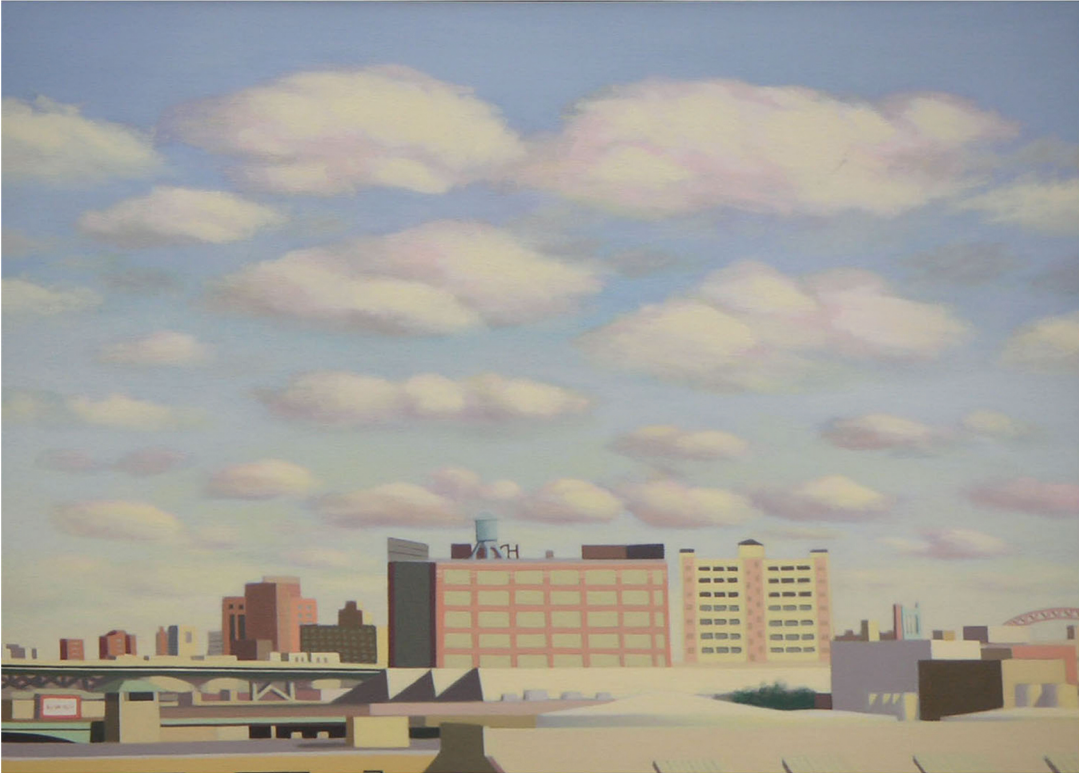
Brooklyn Morning oil on canvas 38" x 52" 2004