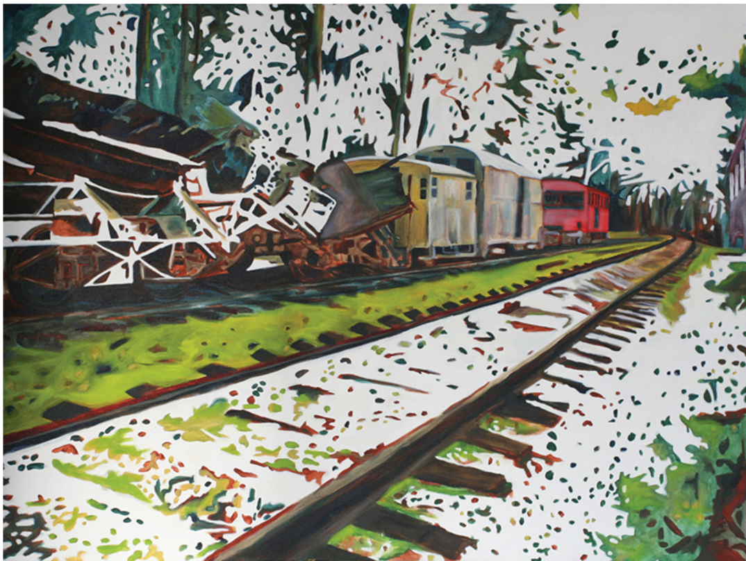
Puget Sound oil on canvas 36" x 48" 2011