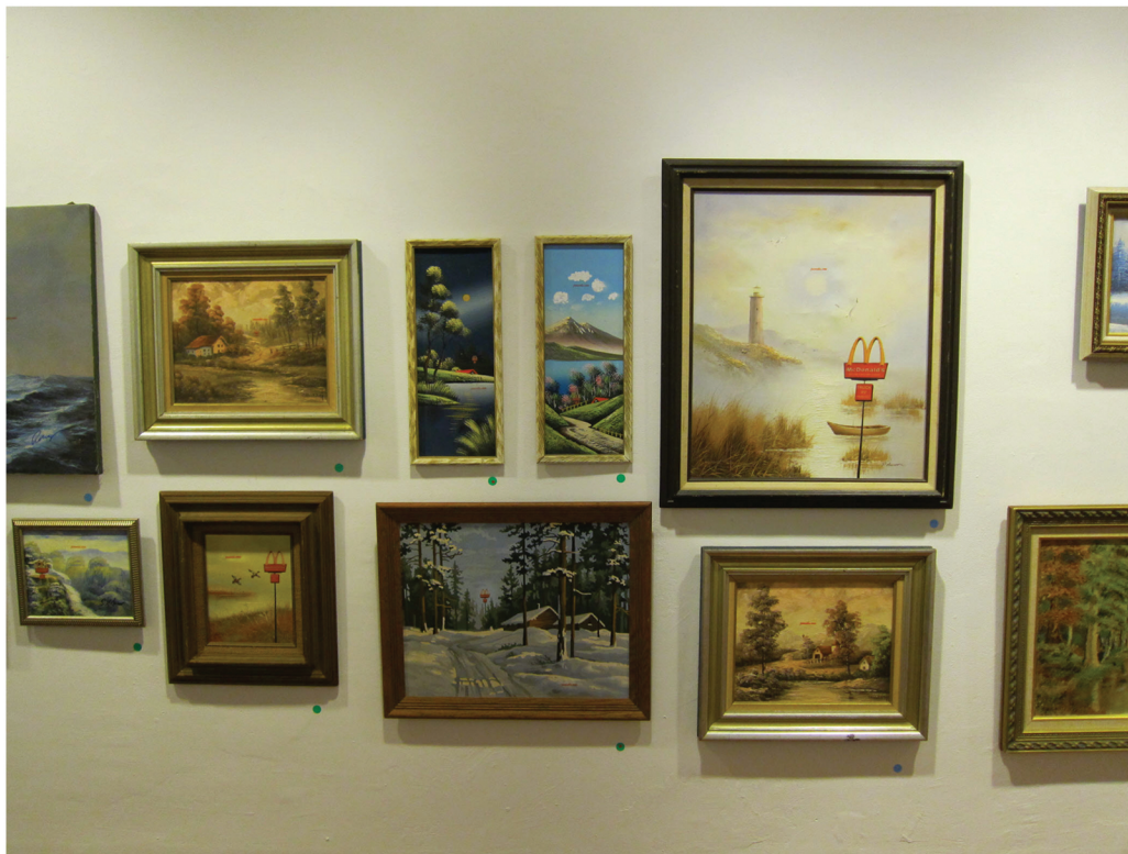
McLandscapes oil and mixed media on canvas dimensions variable 2010