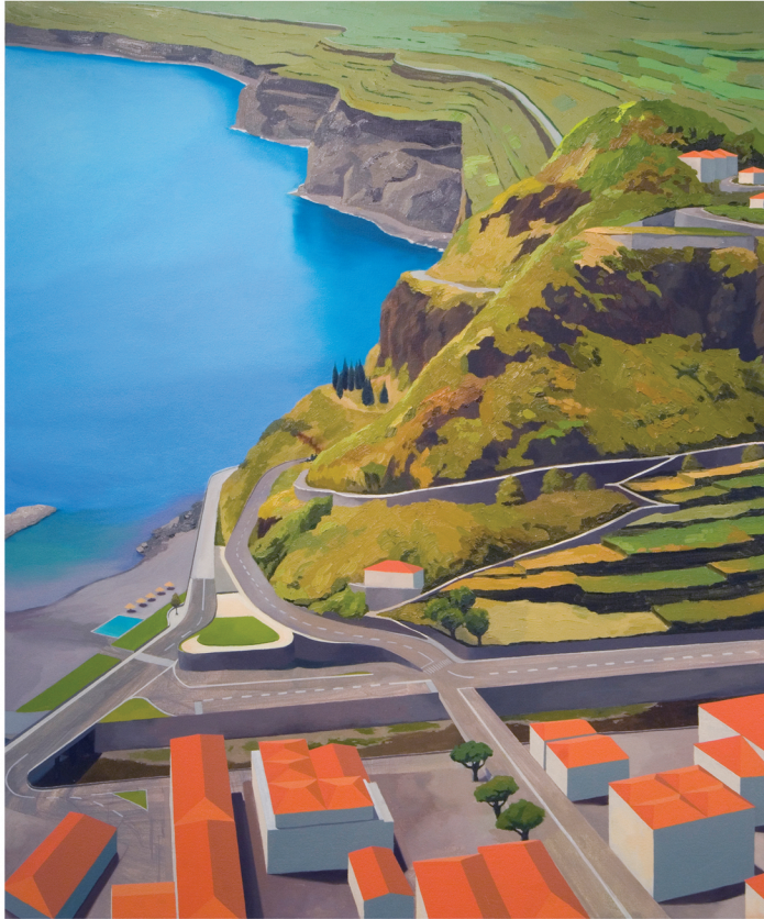
Toy World oil on canvas 48" x 42" 2010