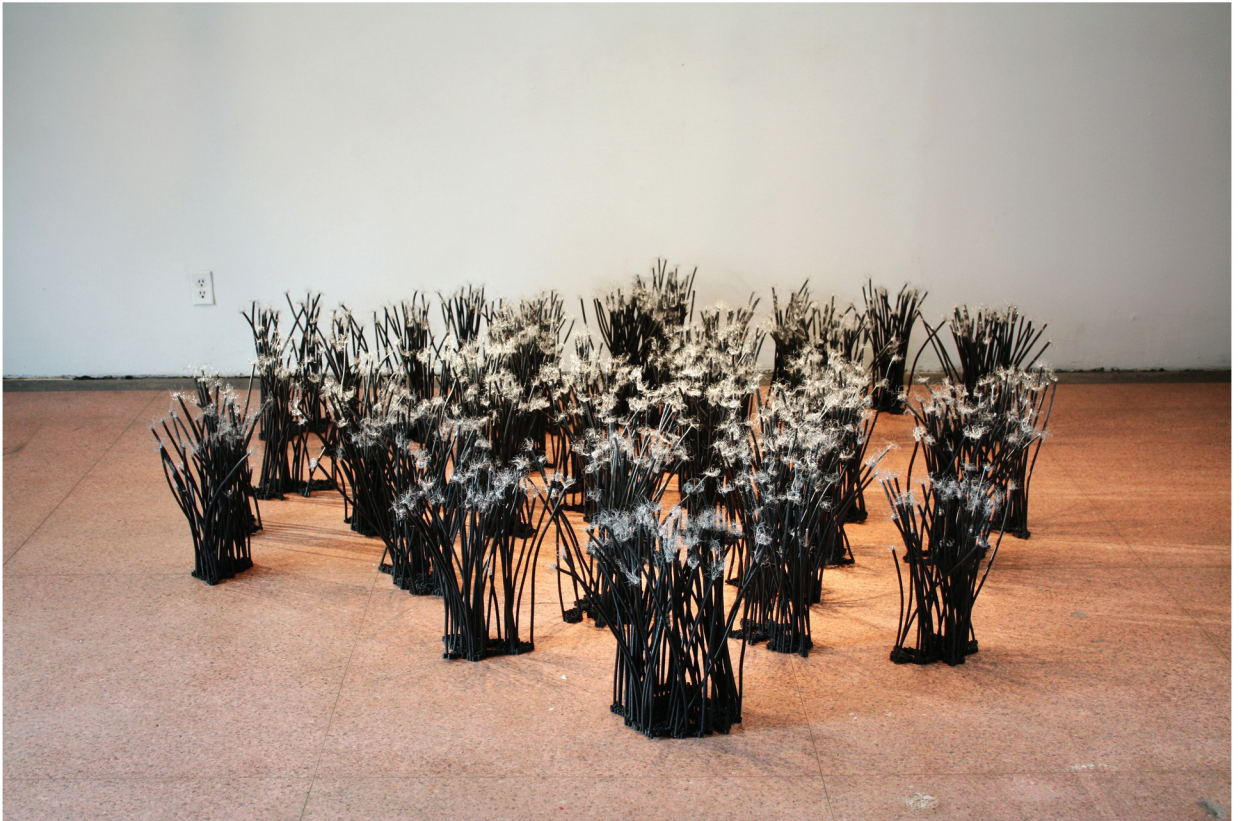
Poppies coaxial cable dimensions variable 2011