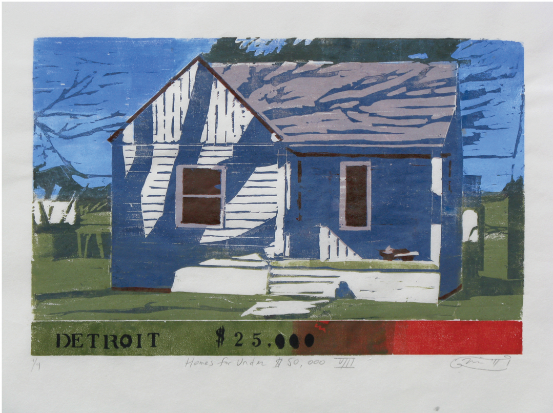
Homes for Under $50,000: Detroit woodcut 20" x 26 1/2" 2011