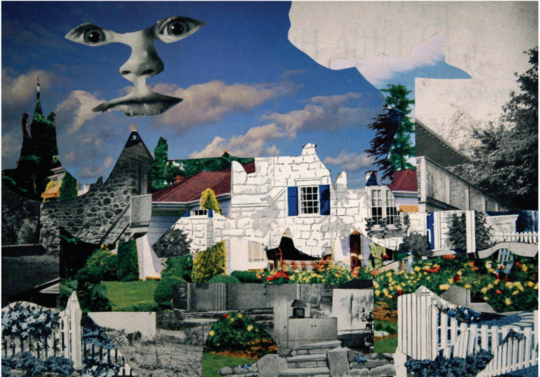
UFO collage on paper 13 ¼" x 17 ¼" 2010