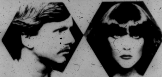
THE NATURAL LOOK