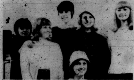
WELCOME SIGHT: The picture above shows next year's freshman class during orientation. The University decided to maintain their cool and not go coeducational. They thought it might be nice to try all girls next time around instead.