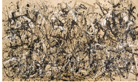
Picture 3: © 2013 The Pollock-Krasner Foundation / Artists Rights Society (ARS), New York

Unlike the other two pictures, the Pollock painting is not overtly political. For many voters, the act of voting is their primary—and perhaps—only overtly political act. Many factors influence lives lived primarily in a non-political space. Various speech may be hurled at voters that later comes to bear on the decisions taken in a voting booth. It is therefore likely appropriate to consider a vision that is a blur of images. Hard as it may have been to read Tweed’s mind, at least until revealed by Nast, it is that much harder to assess what a mass of voters may glean from the variety of messages generated during an election campaign.