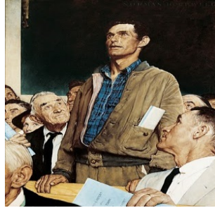
Picture 1: Freedom of Speech Illustration © SEPS. Licensed by Curtis Licensing. All Rights Reserved.

What does this painting reveal? The focus is on a “regular Joe” expressing a viewpoint. Other people—from different walks of life—are listening to him. Is government in the painting? If so, is it an idealized depiction of American government, or rather of just one narrow element of American government at the core of the First Amendment, the town meeting?