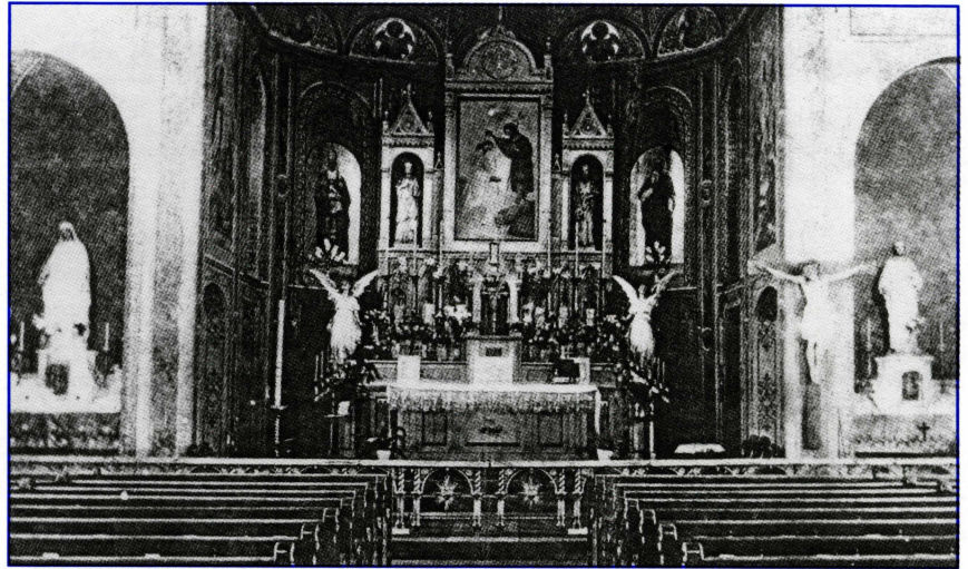
Interior of the Church of St. John the Baptist, New Brunswick