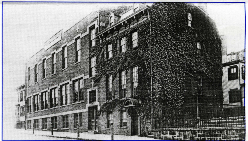
St. John the Baptist School, New Brunswick