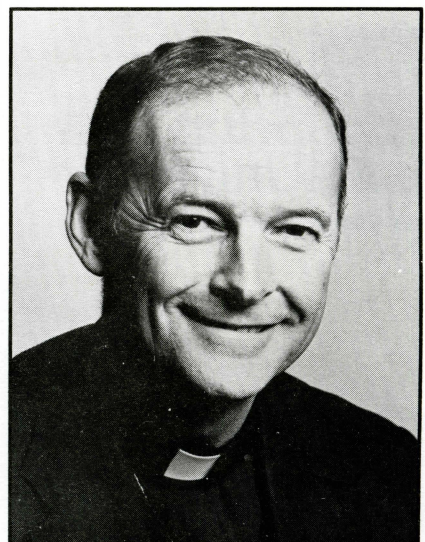
Archbishop Theodore McCarrick