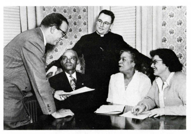
Father Gerety with members of the New Haven Catholic Interracial Council in 1951.