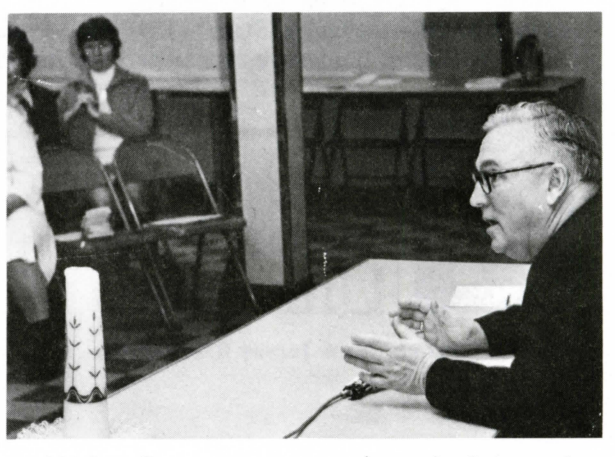
Archbishop Gerety answers questions of religious education coordinators at Assumption in Roselle Park in 1976.