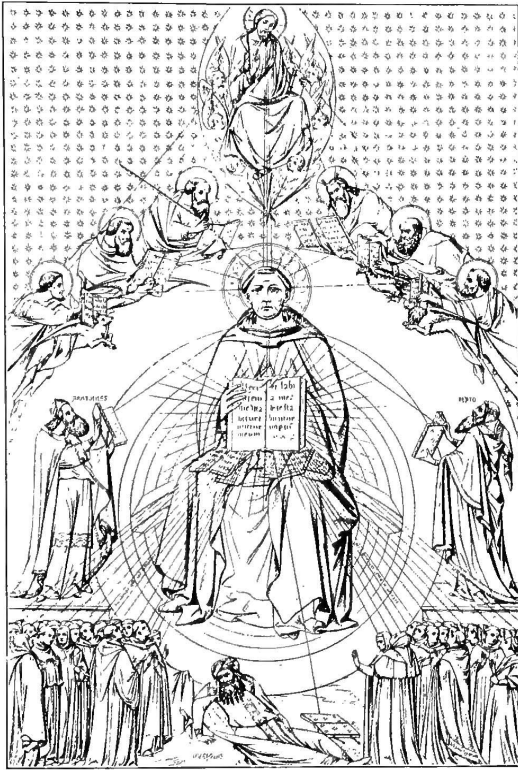
ST. THOMAS AQUINAS OVERCOMING AVERROES