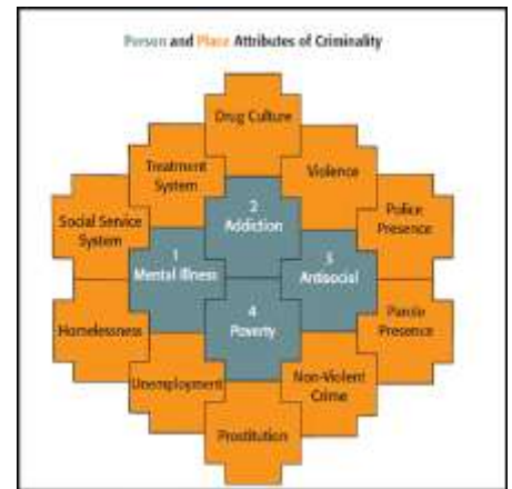
Figure 1: Factors Contributing to Justice-Involvement

A coordinated holistic approach to care is most appropriate given the array of problems the offending population faces, and the dynamic relationship be